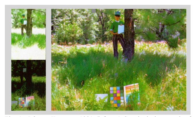
Fig. 1. John at Yosemite, 1981 (left top) Standard photograph of John exposed for shade. (left bottom) Standard photograph of John exposed for sun. (right) Retinex algorithm output made from a calibrated scan of a standard color negative.

Fig. 1, John at Yosemite, 1981, is an example of an HDR image in sun and shade. The photometer reading from the white card in John's hand in shade was equal to that from the black paper in the ColorChecker® in sunlight. The scene was captured on color negative film, scanned and converted to scene radiances by calibration. These scene radiances were used as input to separate RGB Frankle & McCann Retinex calculations. The calculated sensations were scaled by standard tone scale and color enhancement algorithms to match the expected color space to be printed on film. This algorithm realized that calculated sensations are in the middle of the image processing chain.[13]